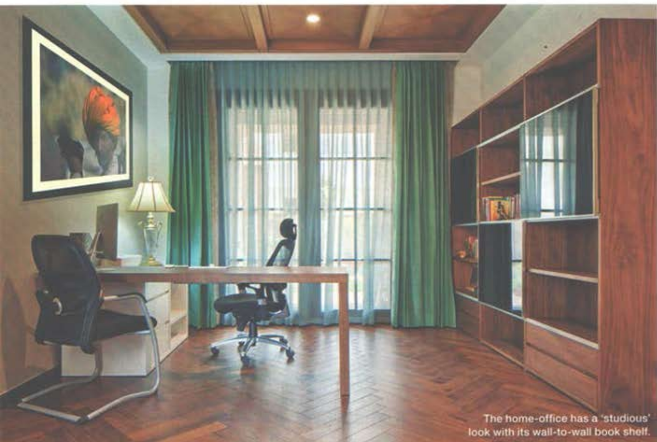
The home-office has a "studious" look with its wall-to-wall book shelf.