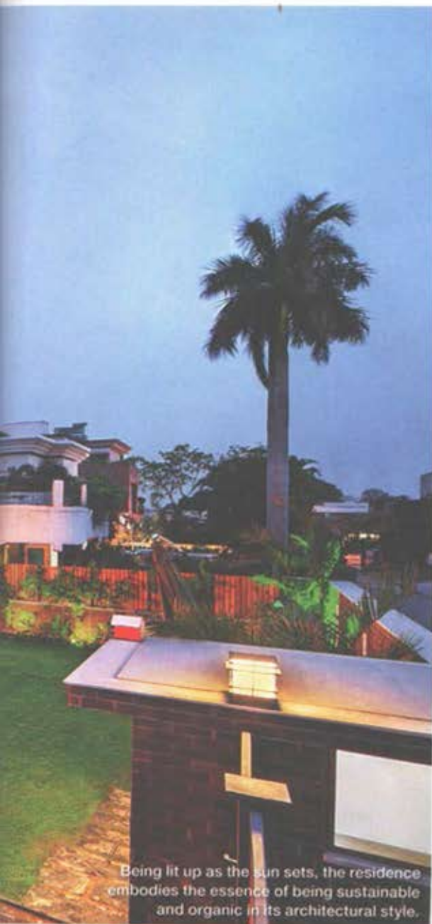
Being lit up as the sun sets, the residence embodies the essence of being sustainable and organic in its architectural style.