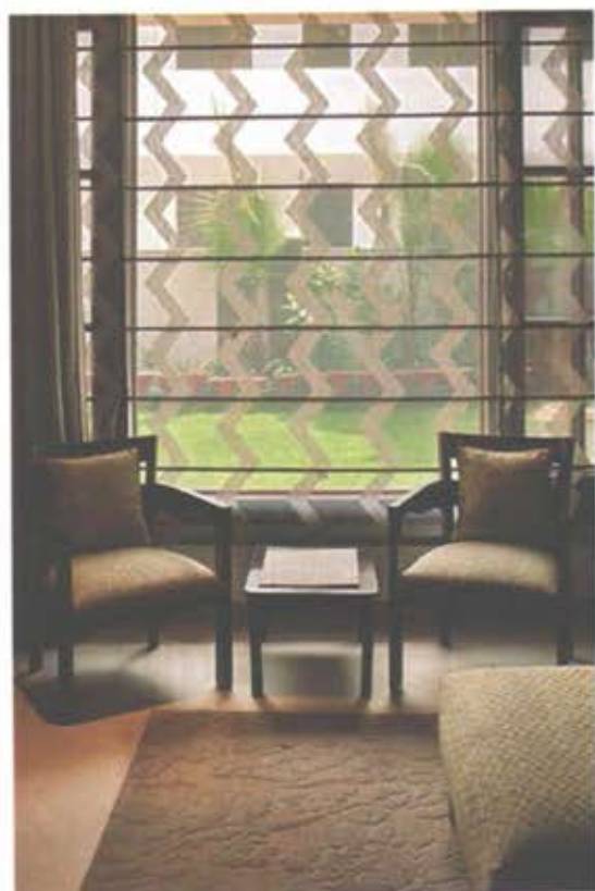
Floor-to-ceiling French windows allow ample daylight into the room.