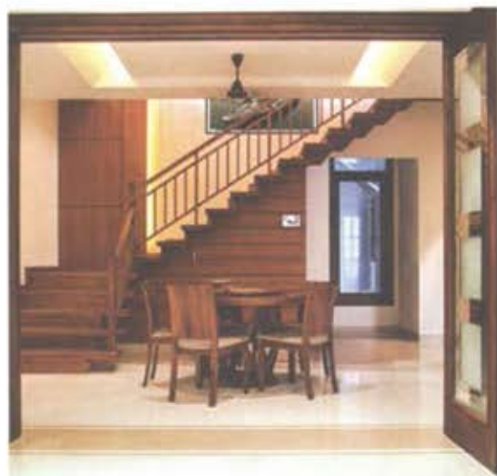
A clever, functional use of wood as a design element in varied forms.

Externally, local materials play an elemental role in defining the edifice. The entire vocabulary of elevation design is embedded with the contemporary use of locally available material.