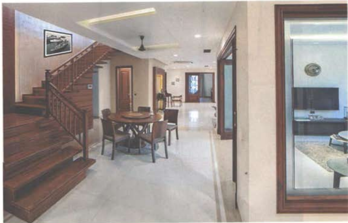
The richness of the wooden staircase leading up to the first floor harmonises with the wood used for the informal dining table, all panelling and doors and windows.