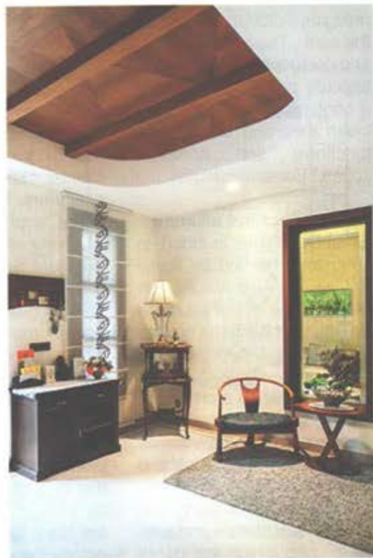
A cosy corner makes a statement with an interesting assortment of furniture.