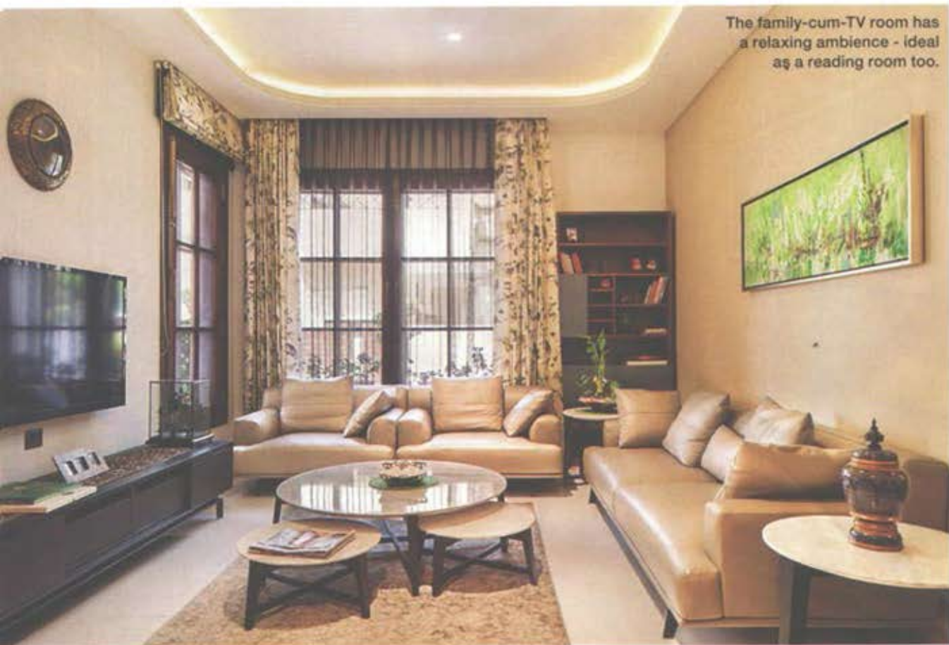
The family-cum-TV room has a relaxing ambience - ideal as a reading room too.

ologies links it back with the earth. The inclusion of art and indigenous crafts strategically positioned allow for a contemporary language of clean lines and uncluttered, functional and spacious zones," Bansal highlights.