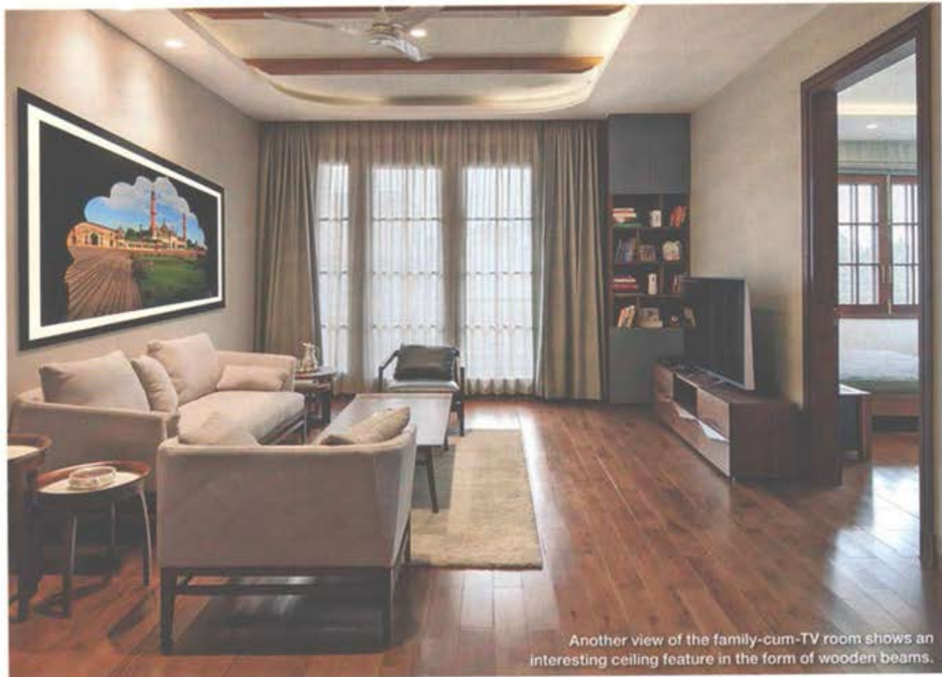
Another view of the family-cum-TV room shows an interesting ceiling feature in the form of wooden beams.