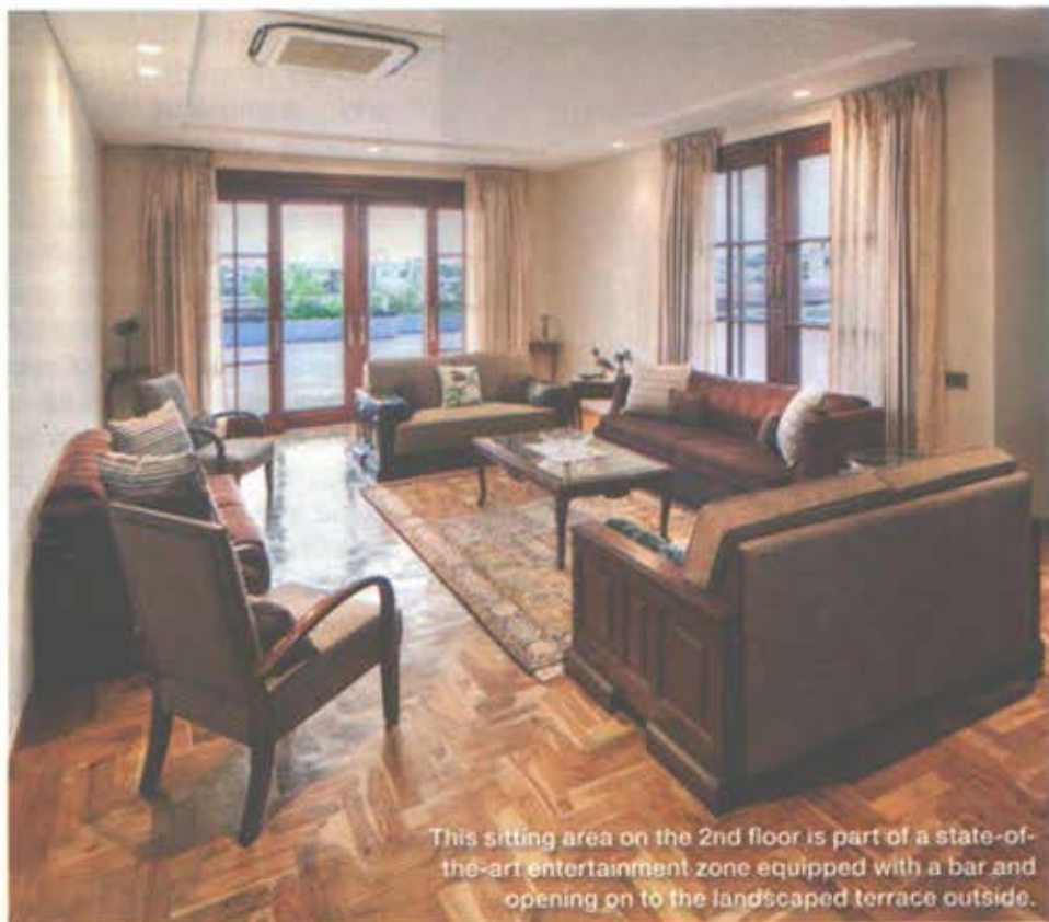
This sitting area on the 2nd floor is part of a state-of-the-art entertainment zone equipped with a bar and opening on to the landscaped terrace outside.

As classmates since 1988 at the School of Planning and Architecture (SPA), New Delhi, they teamed up to execute various academic projects. Upon graduating in 1993 the duo moved on their individual paths to explore and enhance their own interests and diverse skill-sets and imbibe experiential knowledge from interning and working separately in leading architectural firms.