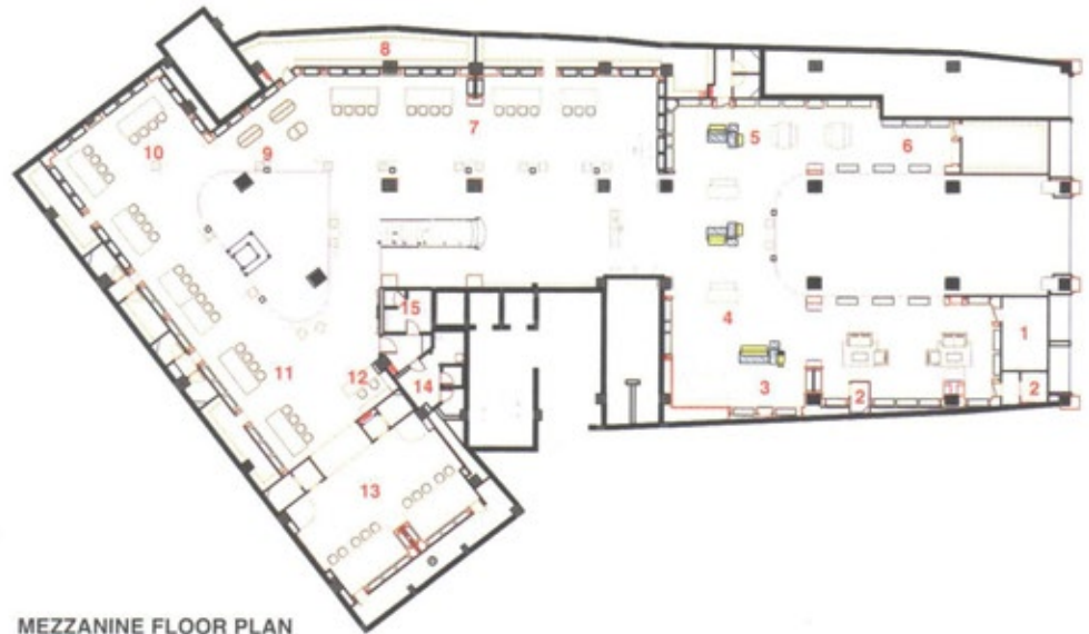
MEZZANINE FLOOR PLAN