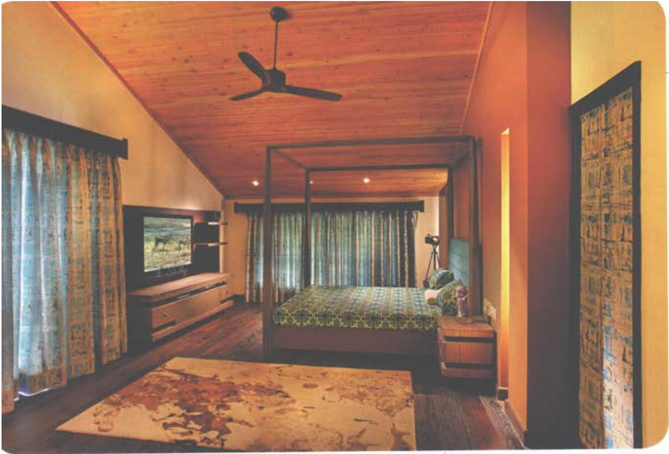
The master bedroom with a an upholstered fabric headboard in teal (above); one of the bathrooms (left)