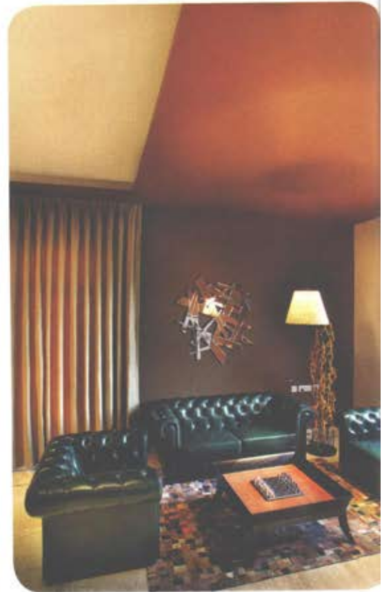
In the formal drawing room, a floor-to-ceiling artwork and a velvet upholstered sofa make a dramatic statement (left); another living area with chic leather couches and unique accessories (above)