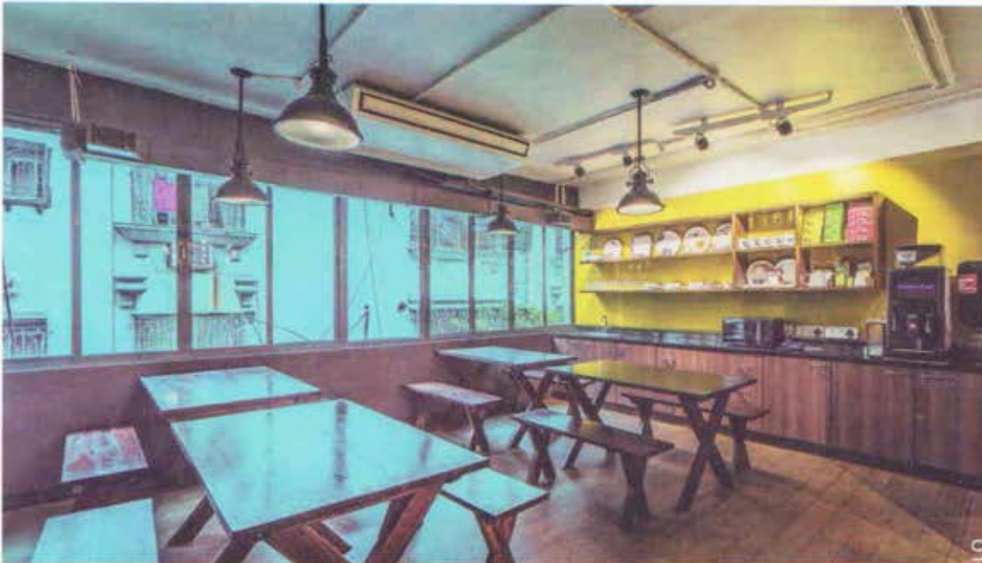
9 The cafeteria has a vibrant look. The exposed pipes on the ceiling lend an industrial feel to this space.

The layout has evolved along these walls, with all the activities like the reception, cafeteria, workstations and the director's cabin receiving ample daylight from these windows. "The meeting room, conference room and marketing director's office, all of which requires extensive visual presentations and need to be shielded from daylight, have been thoughtfully placed in the inner nooks of the premises," he adds.