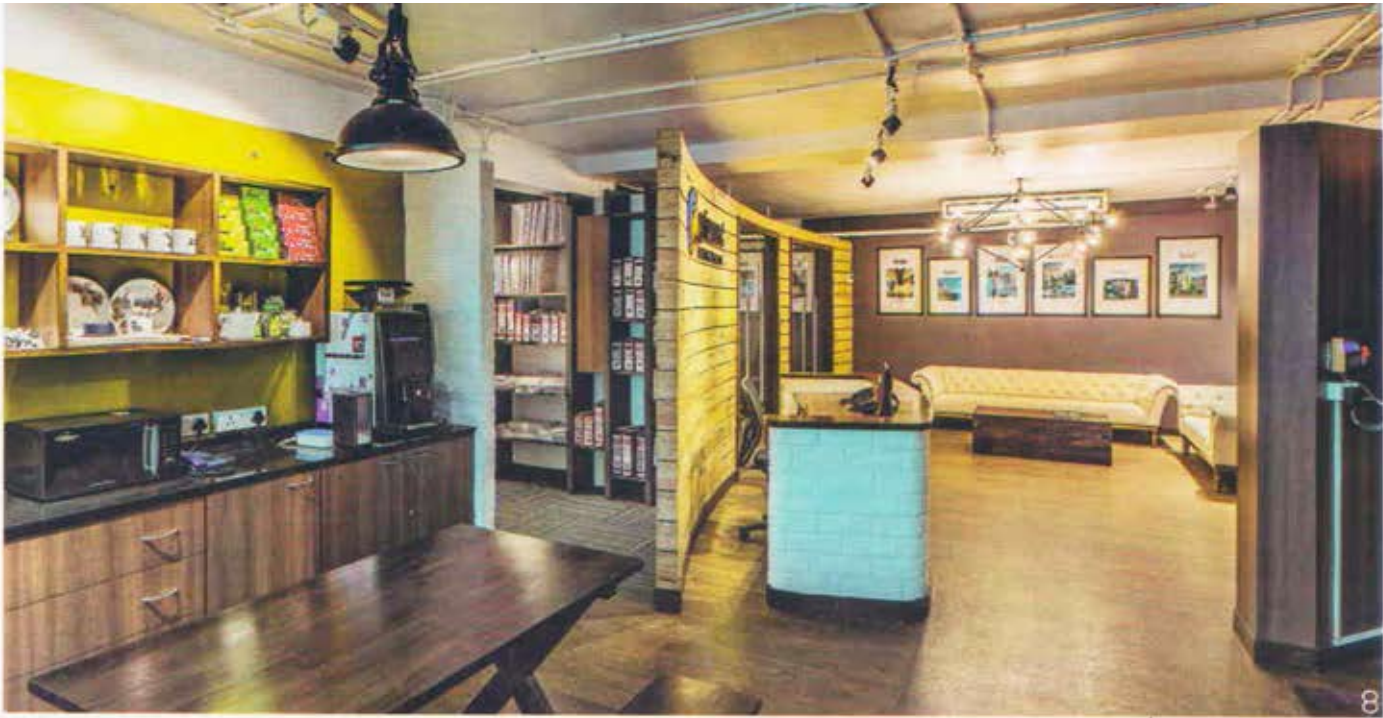
8 The reception area overlooks the cafeteria, in fact the reception merges into the cafeteria.