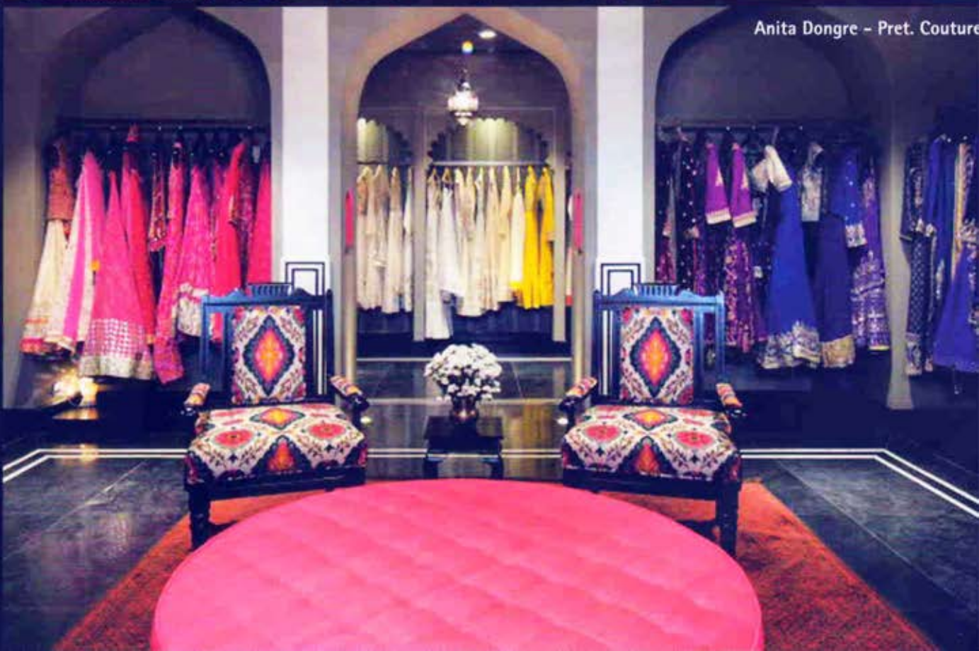
Anita Dongre - Pret. Couture