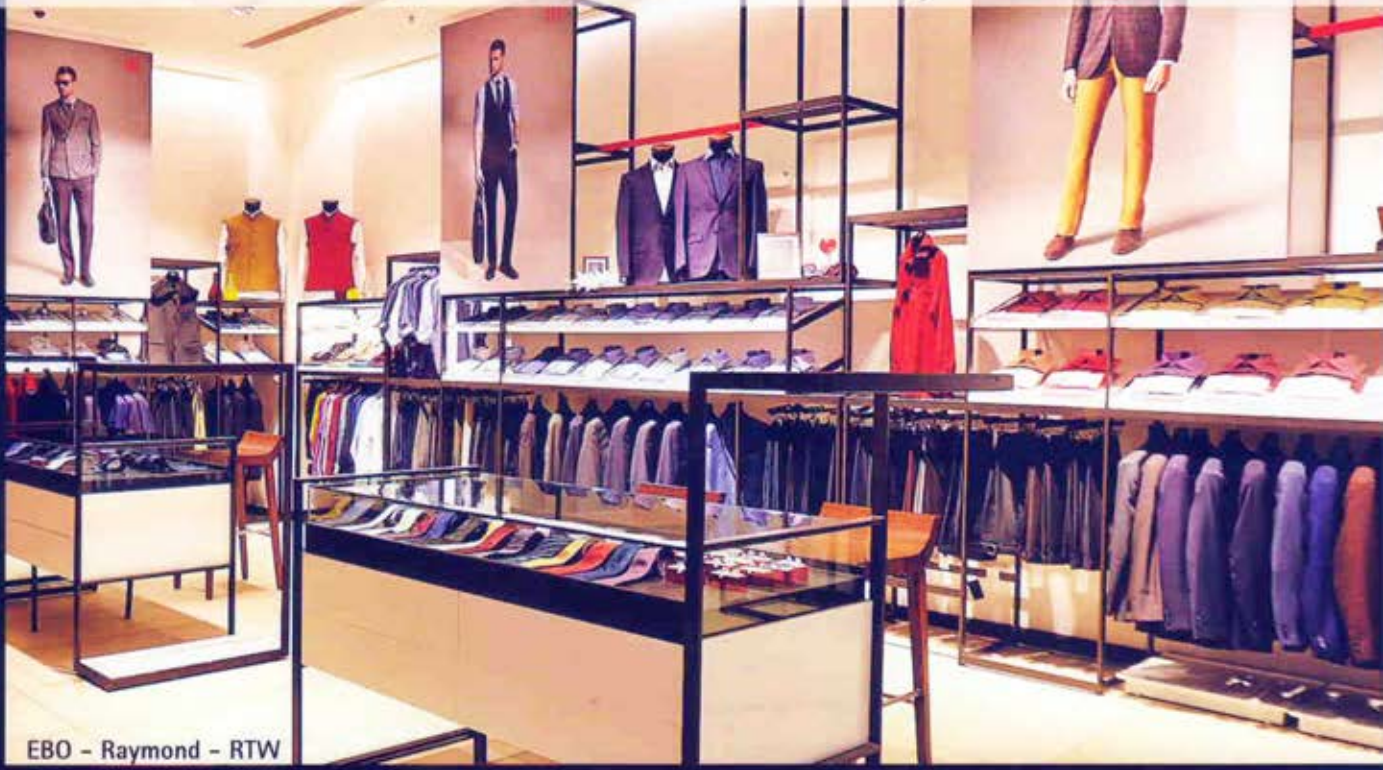
EBO - Raymond - RTW