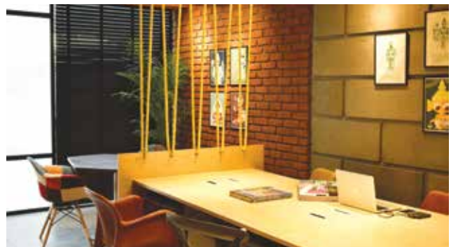
JD Office, New Delhi

Dissolving hierarchal segregations to accommodate socially and physically transparent infrastructure is an integral factor in the design of work spaces