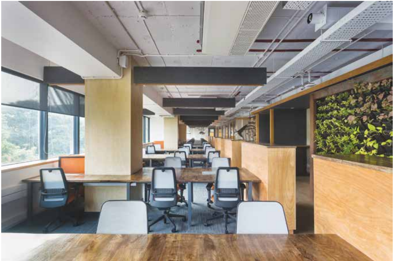
Enrich Office & Academy, Mumbai

these issues, implementing a sustainable design, which is well-balanced, and contextual, using local materials to minimize impact on the environment, and making each project climate-appropriate, will foster longevity as well as worker efficiency.