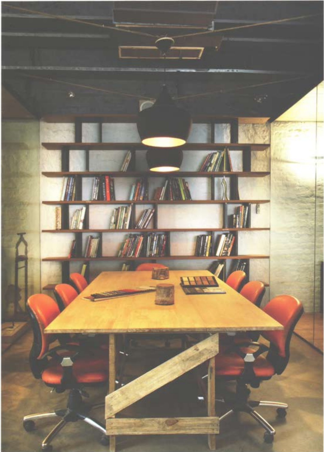
A carpenter's work table ingeniously repurposed as a conference table