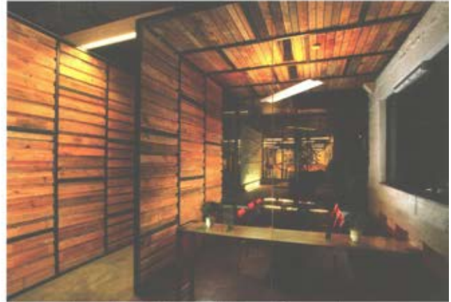
Conceived as a 'box within a box', it provides engaging spaces for both private and communal use

Working within a small budget and in an attempt to make no design compromises, the space has been successfully transformed from an old storage unit to a fully functional work space. A combination of old and new furniture, along with elegantly detailed new lighting aids in creating a conducive ambience. The executed design successfully employs a complex layering of spatial hierarchies that caters to the flexibility essential for a growing design services firm. ■