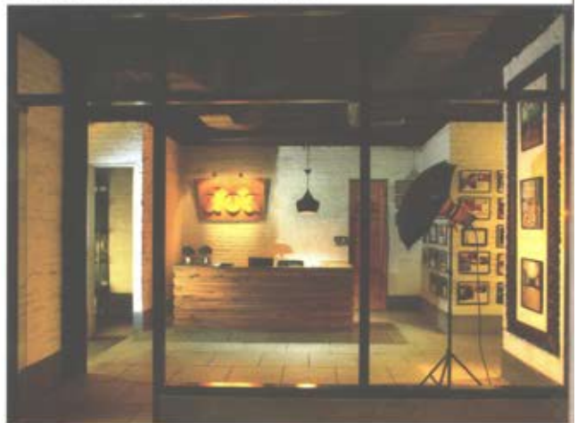
An existing warehouse was transformed into a studio space for an architecture and interior design firm