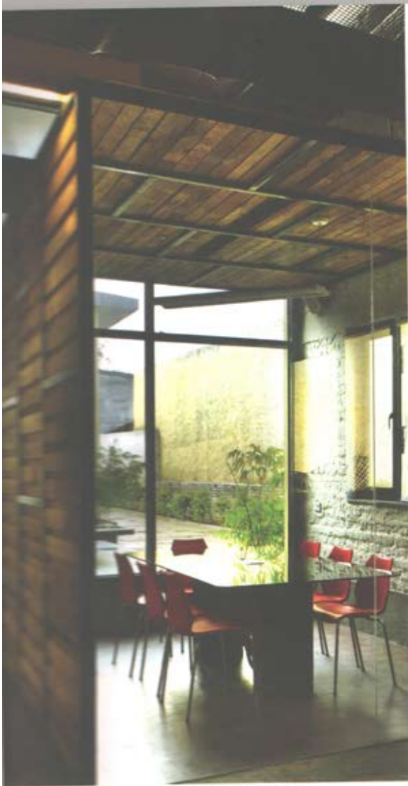
A multipurpose space used for hands-on design and engagement activities

work space for a growing team of design professionals. Additionally, the studio needed to foster a high level of interaction between the two verticals within the company, the studio and the projects team. Conceived as a box within a box, the office space provides engaging spaces for both private and communal use, fostering a sense of creative continuity, allowing spaces for brainstorming and focused work alike.