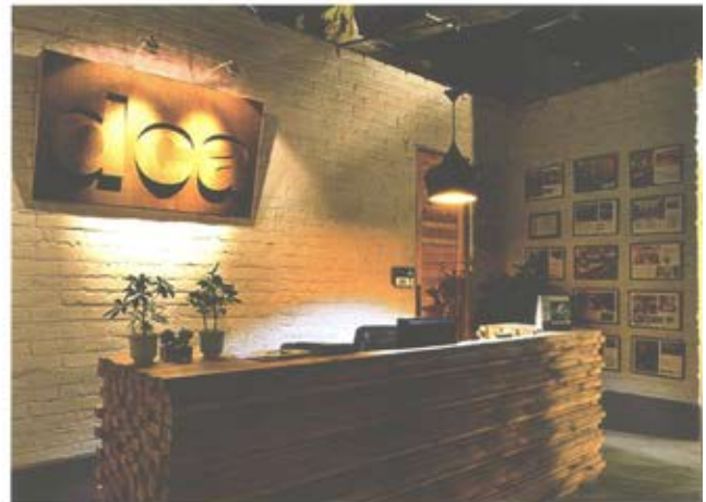
The reception area at the DCA studio