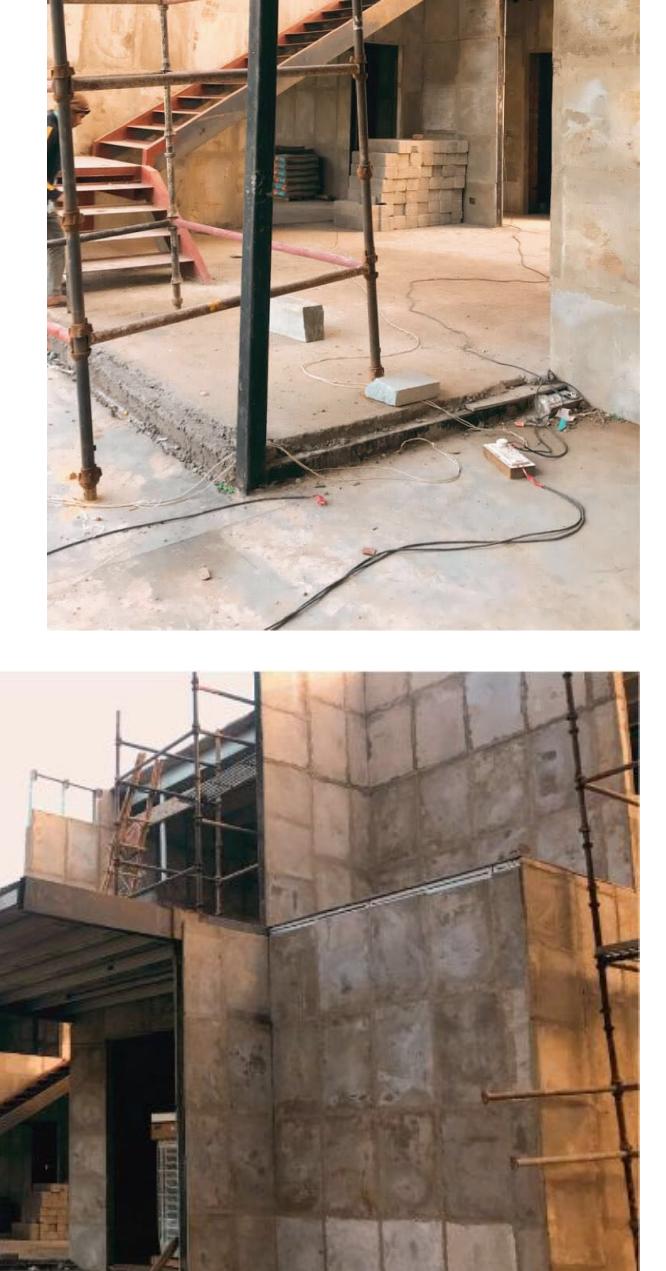
and muted while creating a sensorial experience.