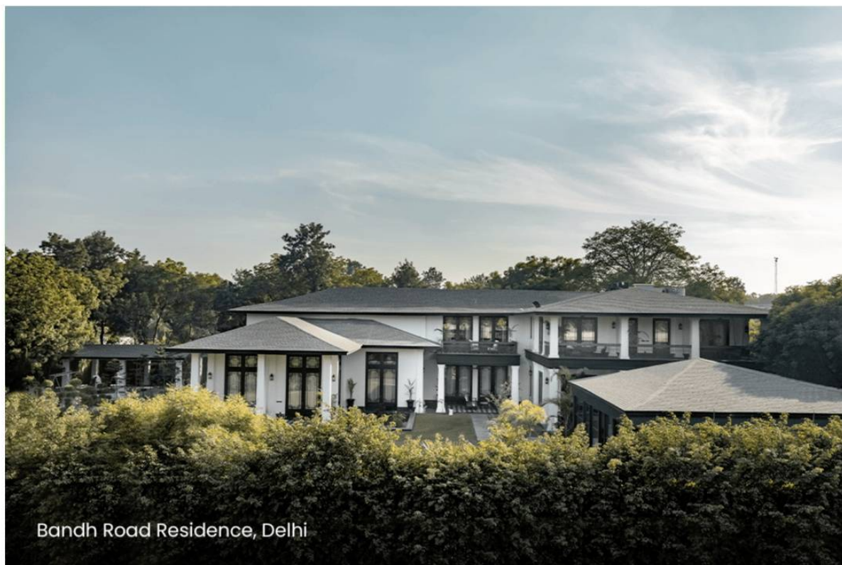
Bandh Road Residence, Delhi

Our recently completed residential project at Bandh Road sprawls across 8,000 square feet on an acre of farmland near Delhi. The residence embodies a relaxed, country-style aesthetic drawing inspiration from colonial architecture. The design prioritises climate-consciousness and simple planning for a comfortable living experience. Rich Victorian influences with warm colors, parquet wooden flooring, and slender windows create a sense of enduring elegance. The robust design utilises classical planning elements to offer adaptable spaces that cater to the ever-evolving needs of modern living.