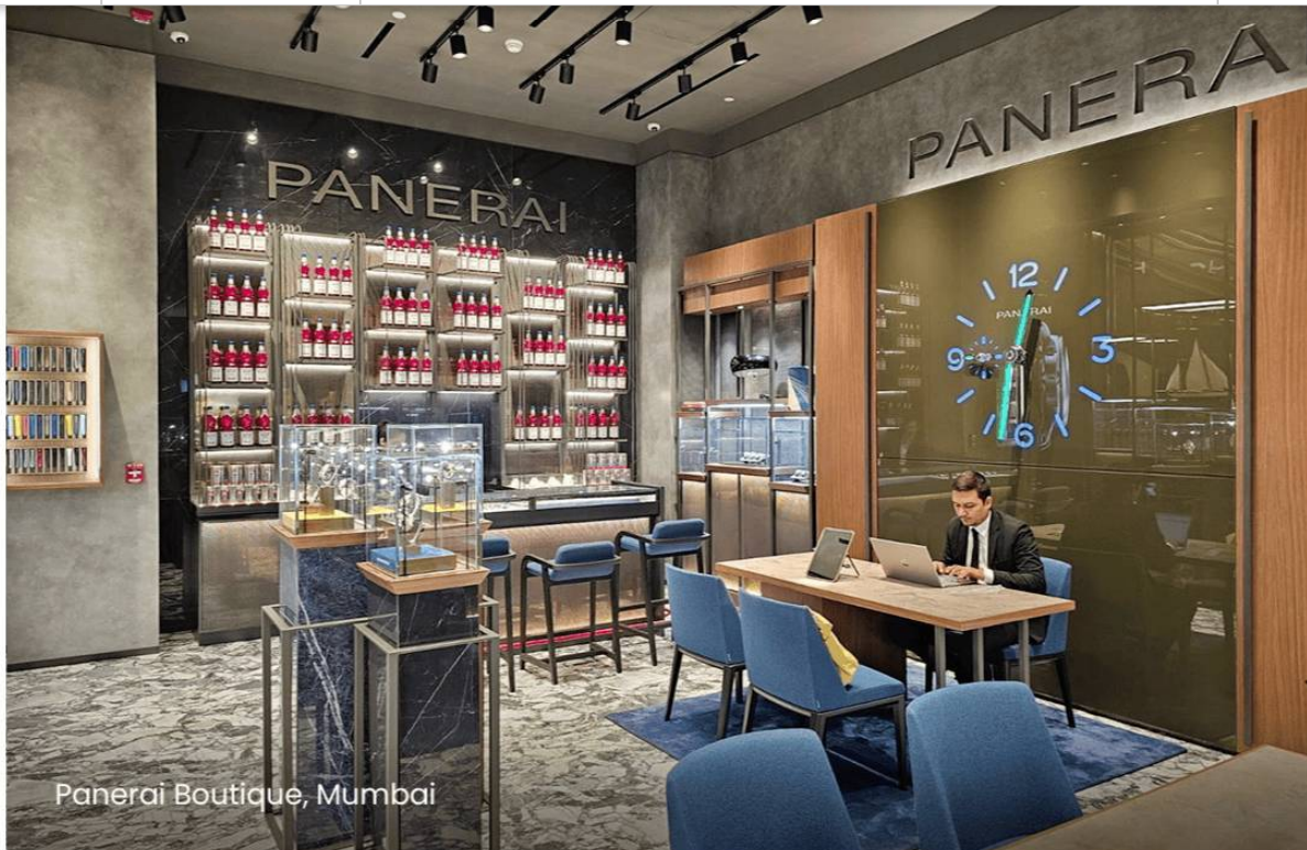
Panerai Boutique, Mumbai

Driven by the client's brief to design an experiential space, our aim was to elevate the essence of luxury timekeeping at Panerai's newest boutique in Mumbai's Jio World Plaza. Spread over a sleek rectangular space, the store's layout is simple yet elegant, mirroring the spirit of adventure and maritime heritage associated with Panerai's legacy of collaborating with the Italian Navy. Exposed concrete walls serve as a canvas for the tranquil blue color scheme, accented by minimal graphics, including a diver's silhouette, subtly capturing the brand's adventurous spirit. The inviting environment allows visitors to immerse themselves in the world of Panerai watches.